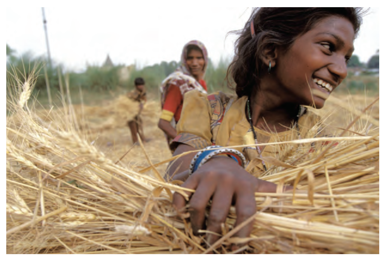
Family harvests wheat, India.