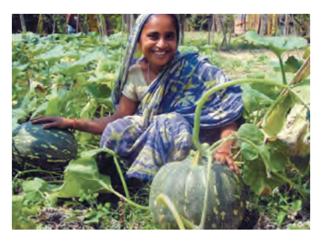
Homestead food production, Bangladesh.

Yet investments in agricultural development have generated sizable dividends for society, demonstrating that agriculture is not only an important means of reducing poverty, but also a worthwhile investment portfolio.