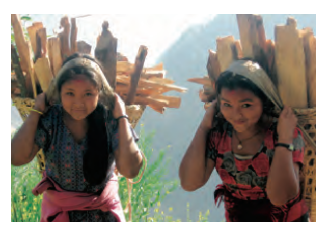
Participation in community forestry, Nepal.

By the 1970s, concerns emerged over the equity and environmental implications of rapid agricultural development. These new concerns encouraged a move away from a strictly yieldincreasing outlook on food staple productivity to a more complex perspective on agriculture and rural development. Sustainable development issues came to the forefront of the development discourse, partly in response to issues accumulated during the Green Revolution, such as the overuse of agricultural chemicals, the depletion of scarce water resources, and the neglect of farmers' input into policymaking. New policies, programs, and investments were specifically designed to integrate rural communities into decisionmaking processes