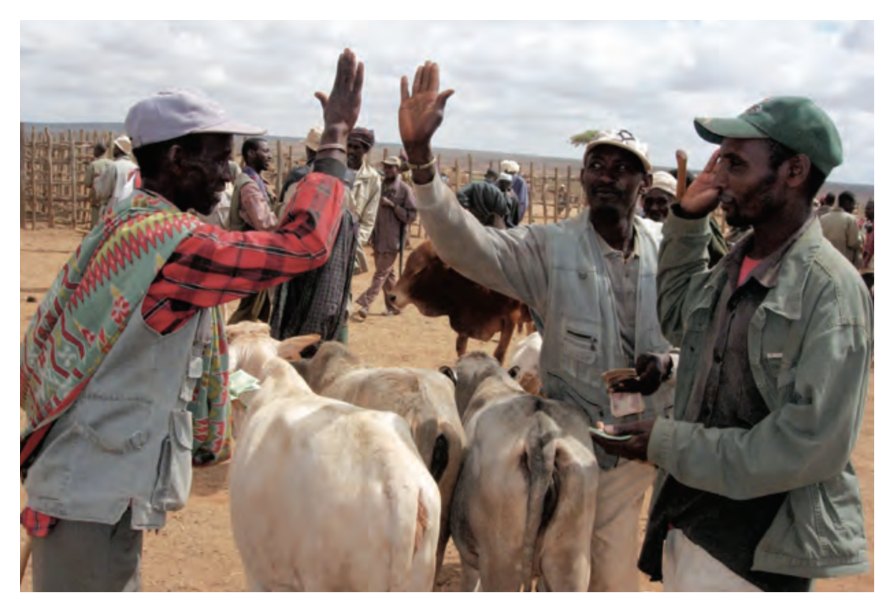
Trading healthy cattle, Ethiopia.

of land in the Indo-Gangetic Plains and generating average income gains of US$180-340 per household, particularly in the Indian states of Haryana and Punjab.