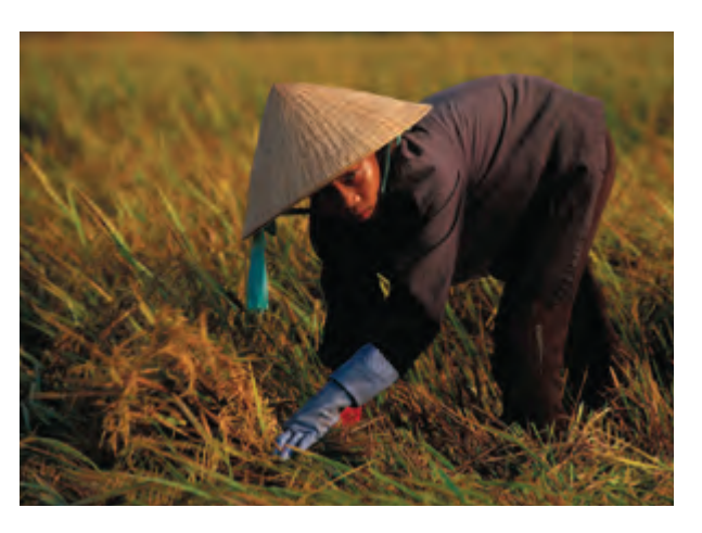
Farmer harvests rice, Vietnam.

In Vietnam, a series of similar reforms between 1987 and 1993 fundamentally shifted the country's economy to a greater market orientation, immediately transforming the agricultural sector. During the period 1989-92, the agricultural sector emerged from its stagnation and grew at a rate of 3.8 percent per year, while the country shifted from being a net food-importing country to the world's third largest exporter of rice in 1989. Within a decade, more than 10 million households representing about 87 percent of peasant households—had received land-use certificates for about 78 percent of Vietnam's agricultural land. These reforms, together with other market liberalization policies, encouraged farmers to produce food staples, livestock, and high-value crops far more productively, and for substantially greater market gain, than