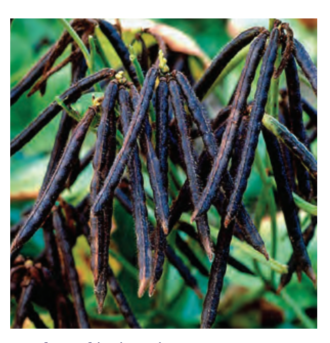
Mungbean cultivation, Asia.

Global efforts to control and eradicate rinderpest—a livestock disease that, in its severest form, is capable of killing 95 percent or more of the animals it infects—reiterate the importance of livestock to rural livelihoods and food security. Concerted global, regional and national efforts in recent decades to control the spread of rinderpest through cattle vaccination, quarantine measures, and disease surveillance have played an important role in securing the livelihoods of small-scale farmers who keep livestock, as well as pastoralists whose livelihoods depend primarily on the health of their herds. Programs operating in Latin America, Asia, and Africa have helped to avoid potentially massive financial losses in terms of milk, meat, animal traction and, for many pastoralists, their main livelihood assets, and have brought rinderpest to the edge of eradication, the first time a disease has been eradicated since smallpox in humans.