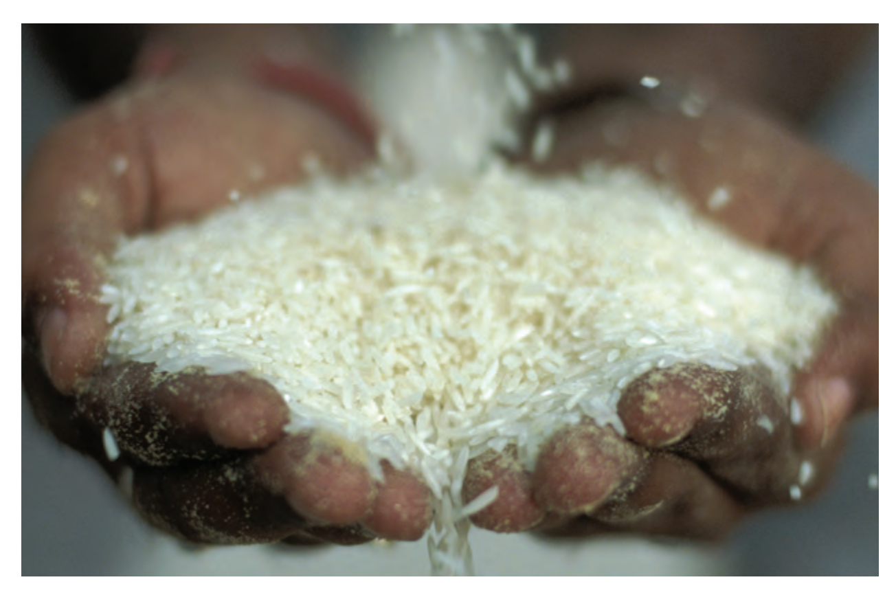
Freshly milled rice, India.

to account for 90 percent of the increase in rice production in Bangladesh between 1988 and 2007. And with this growth in rice production came a decline in the real rice prices facing foodinsecure households and ultimately significant reductions in poverty in the country.