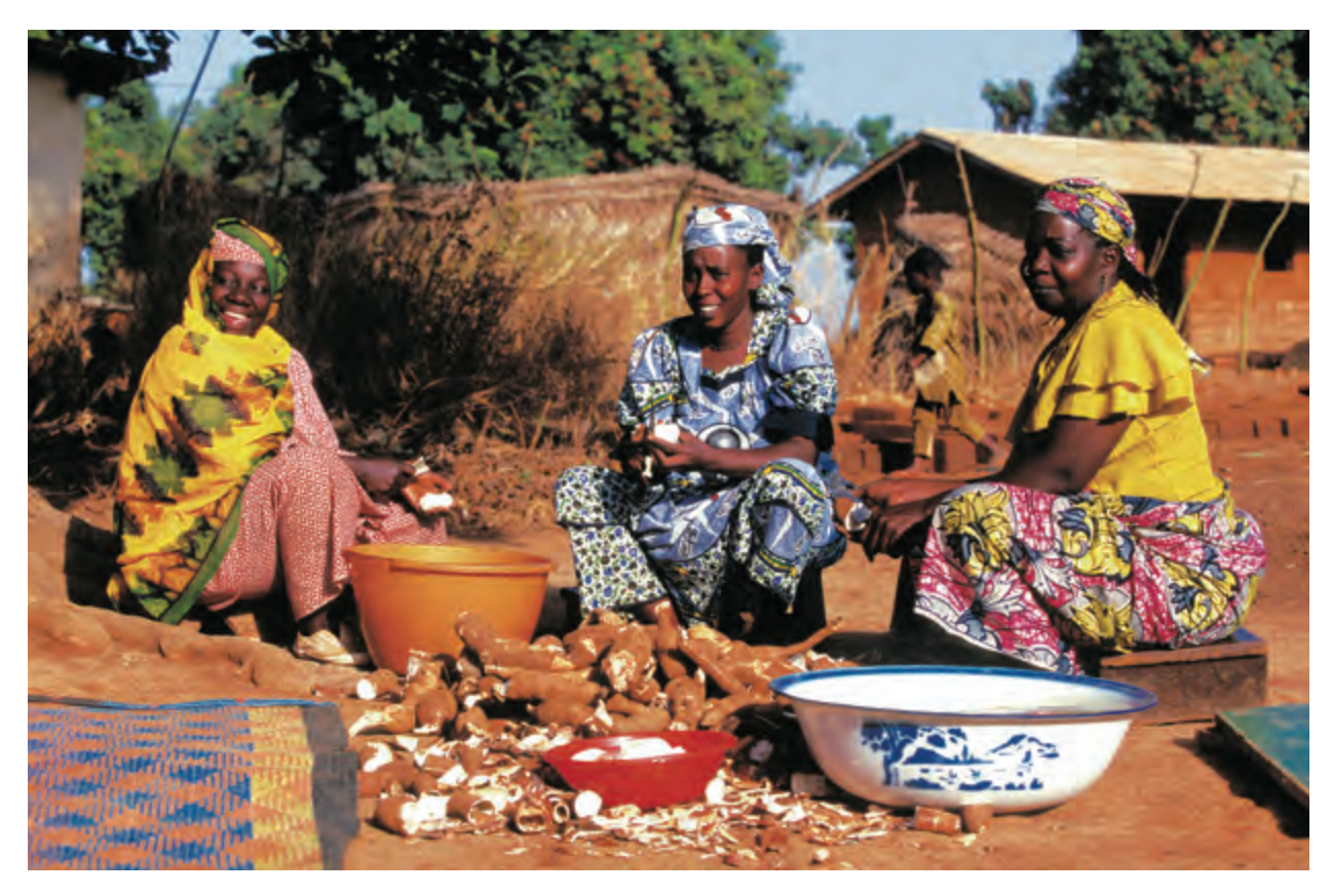
Processing cassava, West Africa.

to finding scientific solutions to ending hunger and food insecurity.