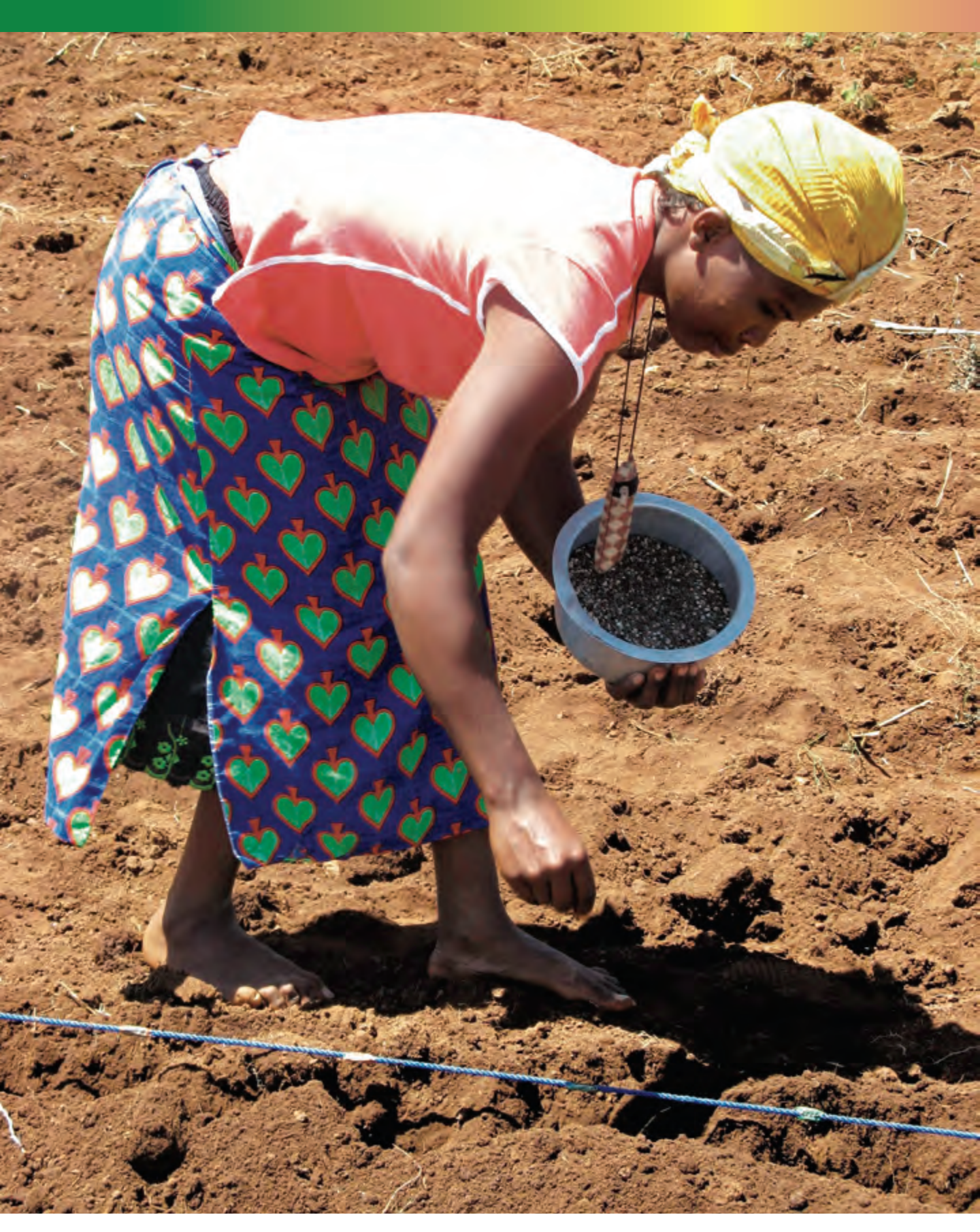
Farmer\ applies\ fertilizer\ to\ maize,\ Kenya.