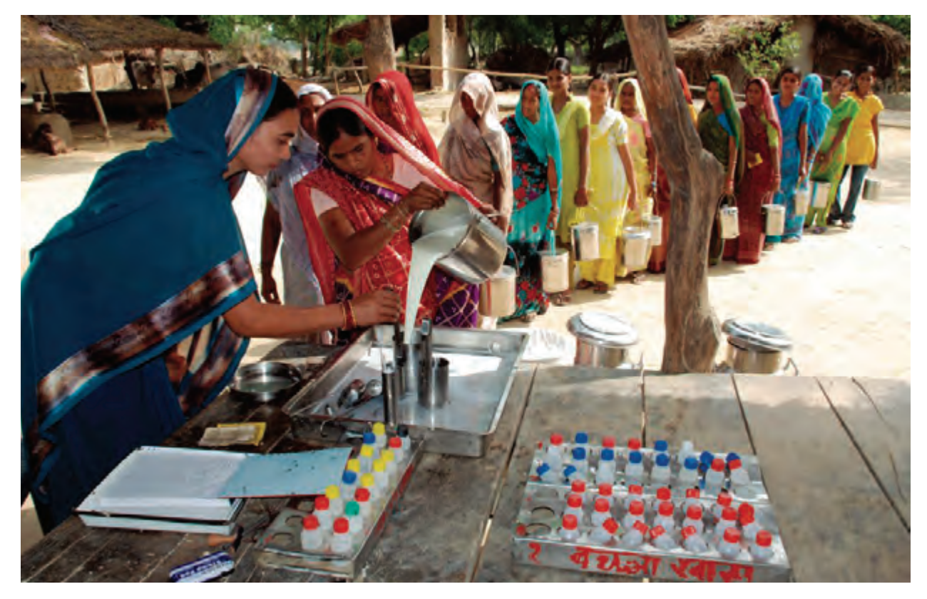
Smallholder dairy producers measure milk, India.

In India, Operation Flood, an innovative national program that ran from 1970 to 1996, helped create a national dairy industry that integrated small-scale farmers—many of them women-with village-level dairy cooperatives, commercial dairy processors and distributors, and new technologies to modernize the industry. With the backing of a supportive policy environment that ensured the dairy industry's steady growth and development, India went from being a net importer of dairy products to a major player in the global dairy market. Between 1970 and 2001, dairy production in India increased at the respectable rate of about 4.5 percent per year, with estimates during 2007–08 indicating that dairy production has exceeded 100 million tons per day. As a result, millions of consumers now have better access to milk and other dairy products.