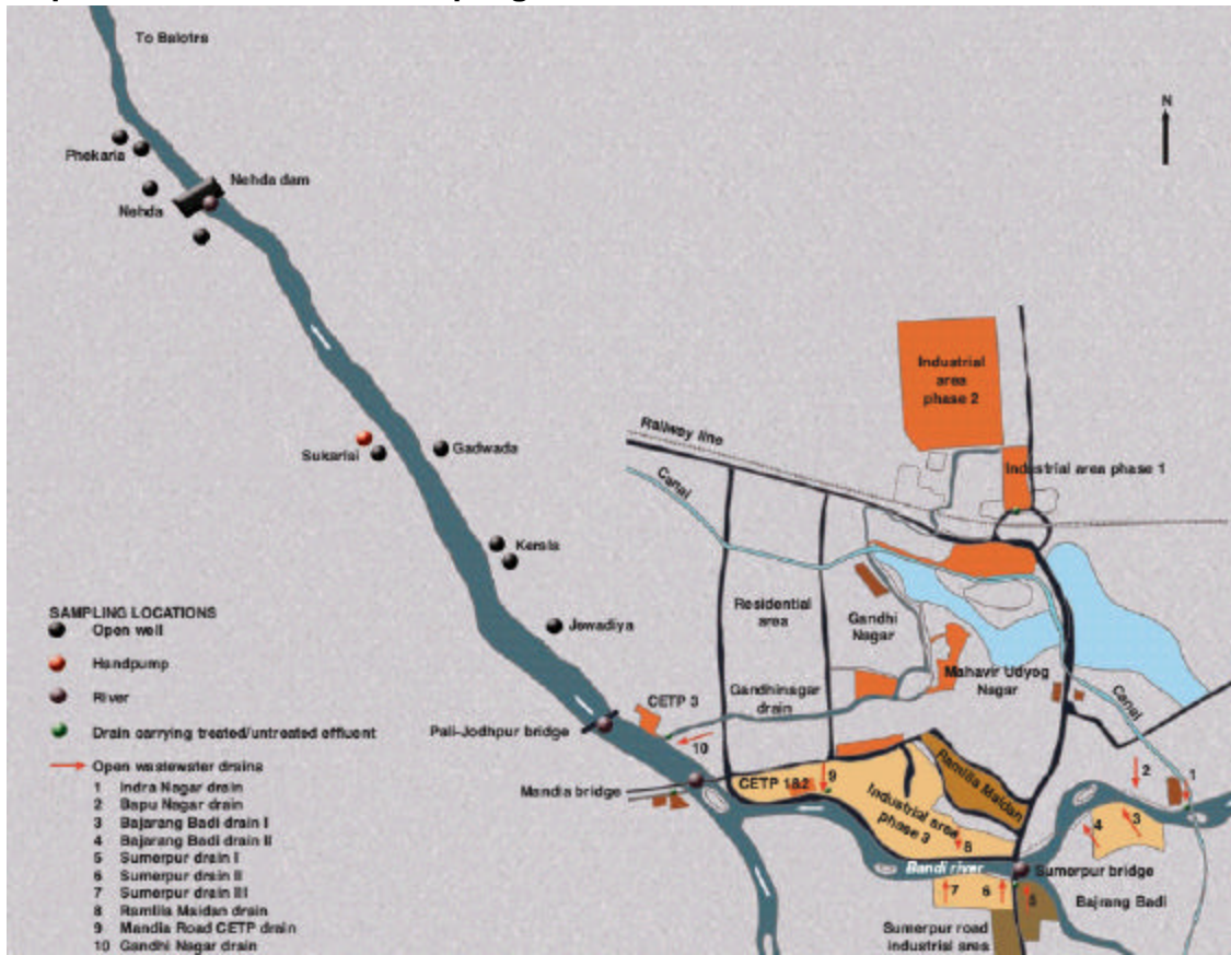
Map: Bandi river and the sampling locations