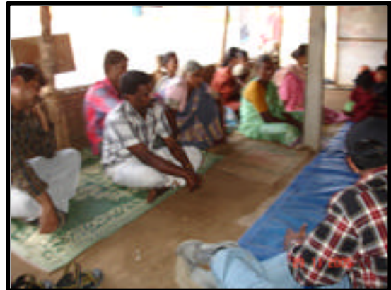
Community people briefing their problems

A meeting was held with the nearby village community. The experience of the community in the pre and post project periods as articulated by them can be summarised as: