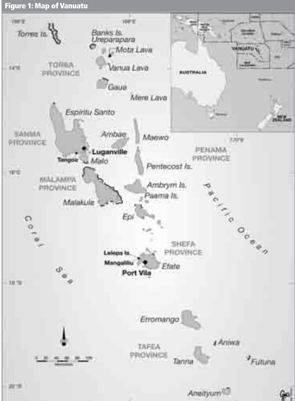
Map prepared by Max Oulton, Department of Geography, Tourism and Environmental Planning, The University of Waikato.

level rise threaten to exacerbate the risks already posed from current variability and extremes. These will be the most significant implications in the short to medium term.