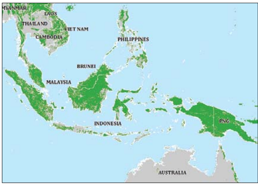
Figure 1: Map of Southeast Asia

use change presents important elements to improve the design of national REDD strategies. Lessons from payments for environmental services (PES) schemes also provide important insights for REDD design.