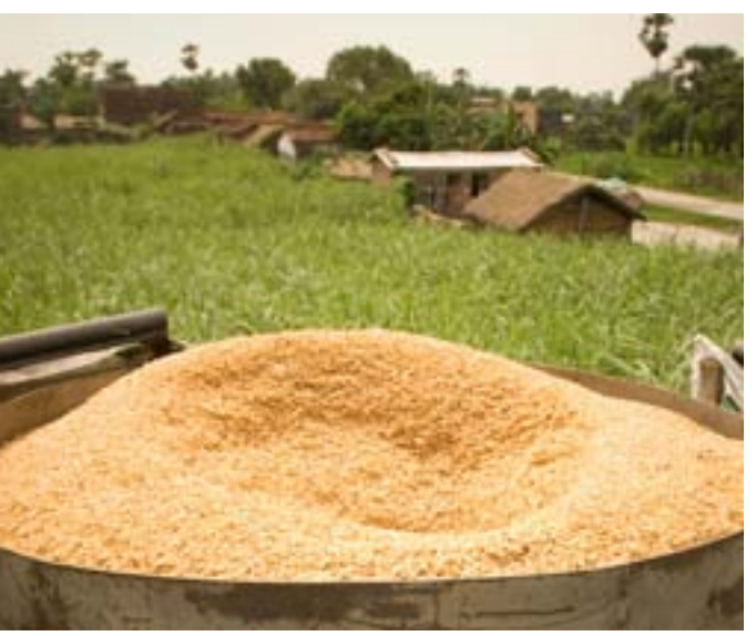
Image: Rice husk is used to feed the reactor at the 8kVA power plant, owned and operated by Husk Power Systems Pvt. Ltd.

<sup>1</sup>See STILL WAITING - A report on energy injustice, Greenpeace India Society, October 2009 http://www.greenpeace.org/india/press/reports/stillwaiting