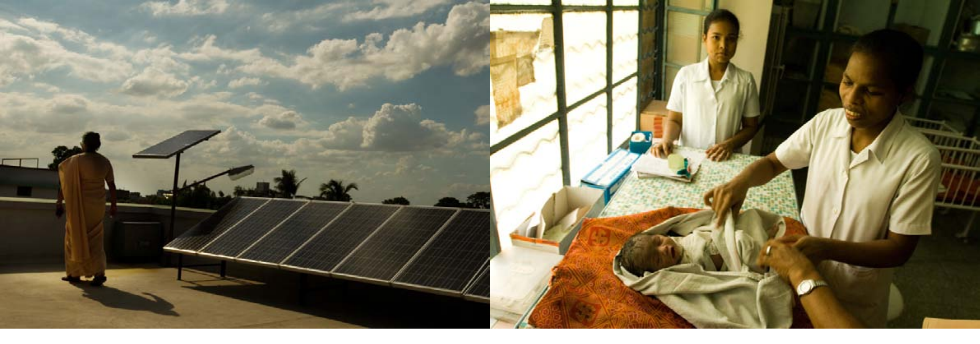
Image: Solar photovoltaic panels on the roof provide electricity to power lights, fans and computers in the building below. Tripolia Hospital, Patna.

Image: A nurse tends to a newborn baby delivered by Caesarian section in Tripolia Hospital. Both the medical instruments the Caesarian was performed with, and the clothes the baby is wrapped in, are sterilised by the hospital's steam-generating solar system on the roof.