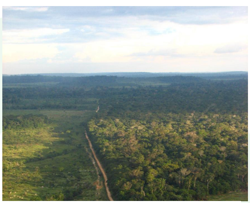
Deforestation as a result of GM soy plantations in the Brazilian Amazon